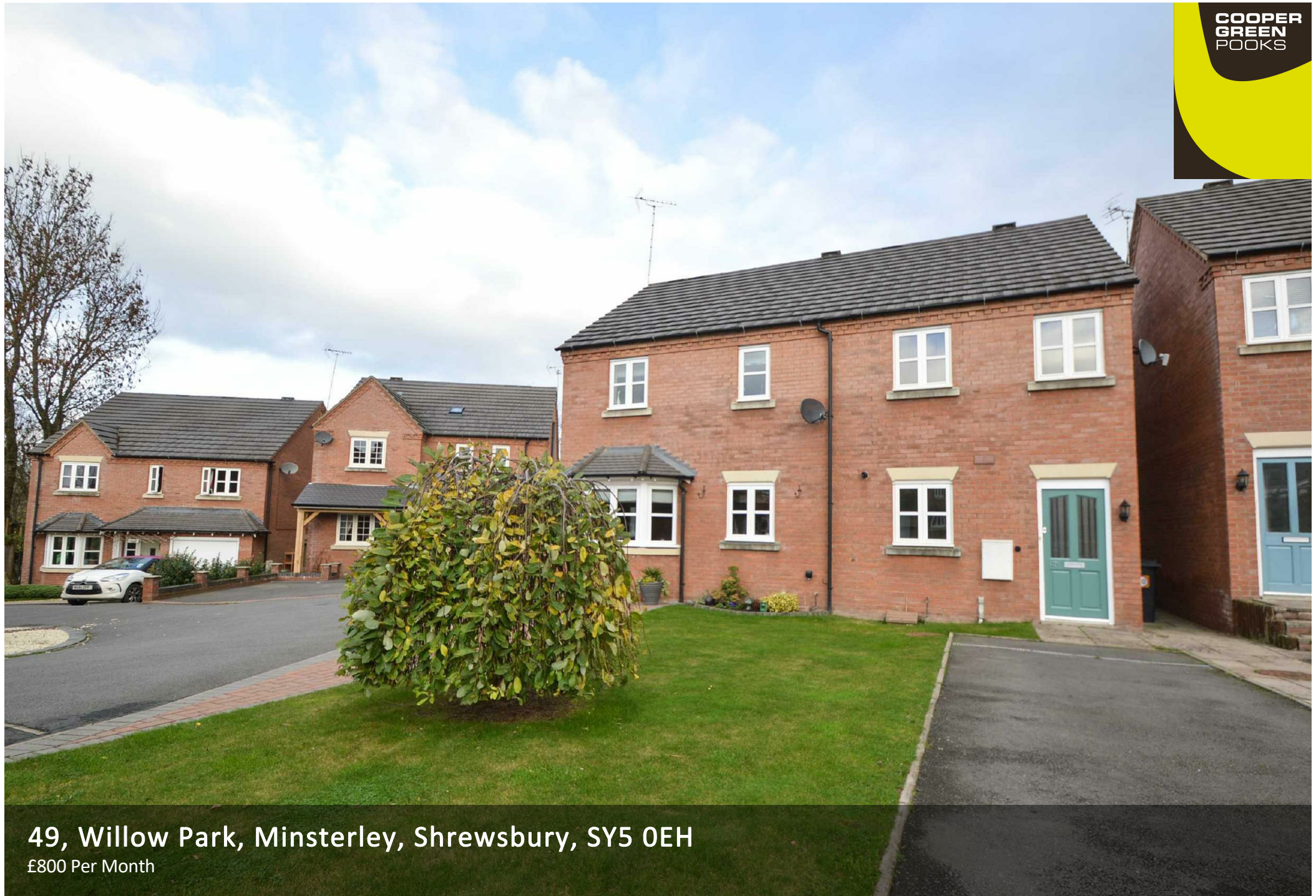
49, Willow Park, Minsterley, Shrewsbury, SY5 0EH £800 Per Month